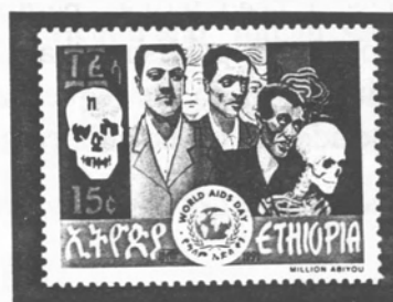
Fig. 3: Graphic lifespan of a PLWA tells it the way it really is!