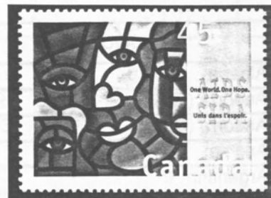
Fig. 6: Canada's conference image.

personally find the suffering and demise of so many of my brothers and sisters offensive.