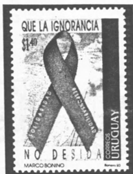
Fig. 1: The Red Ribbon is used as the design on several stamps.

Of the 58 countries that have issued AIDS awareness stamps to date, at least six (US, Philippines, Uruguay, Paraguay, France, Bahamas) have used the red ribbon [fig. 1] as part of or the entire design for the stamp.