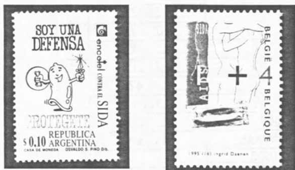
Fig. 4: "Comic" condom from Argentina, or the "real thing" from Belgium.

Perhaps the complacency of the country is exhibited through the design used or perhaps it's the denial factor sneaking in. An opportunity is presented to create a very viable educational vehicle, yet it is smothered out by someone's fear of offending others or not being politically correct. AIDS is with us, AIDS is killing us. We need AIDS awareness by whatever means we can muster! Too bad if the sight of a condom on a stamp [fig. 4] offends someone...that condom could save someone's life!