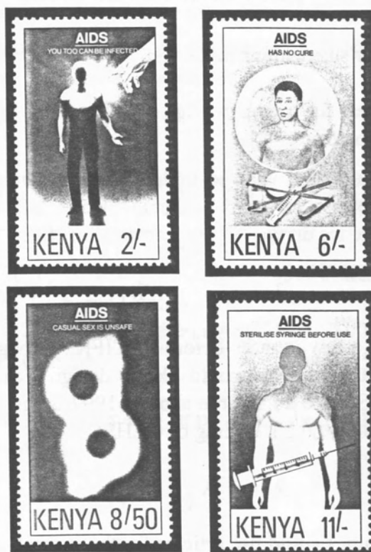
Fig. 2: Kenya's set of four speak graphically as well as verbally.

On the other hand, take a look at some of the AIDS awareness stamps issued by some of the African countries. Kenya used a very direct message on each of its four stamps: "You too can be infected", "AIDS has no cure", "Casual sex is unsafe" and "Sterilize syringe before use." The graphics speak for themselves [fig. 2]. Ethiopia holds back nothing when it comes to their second issue. On this issue, the lifespan of a person with AIDS is graphically portrayed in four stages; from the healthy, full-faced person to the thinning face, then the sunken face, and finally, just the skull [fig. 3].