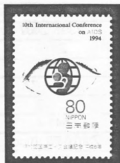
Fig. 5: Japan uses conference logo.

Now to my point at hand! In 1994, Japan issued an AIDS related stamp to commemorate the Xth International Conference on AIDS. What did they use as the design - the logo image of the conference! Nice, but what does it mean? The real issue of AIDS in that country was skirted by hiding behind the conference logo [fig. 5].